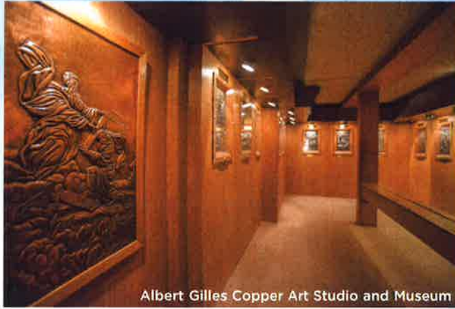
Albert Gilles Copper Art Studio and Museum